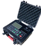
PWHY680 Control remoto con impresora y visor / Remote control with printer and display